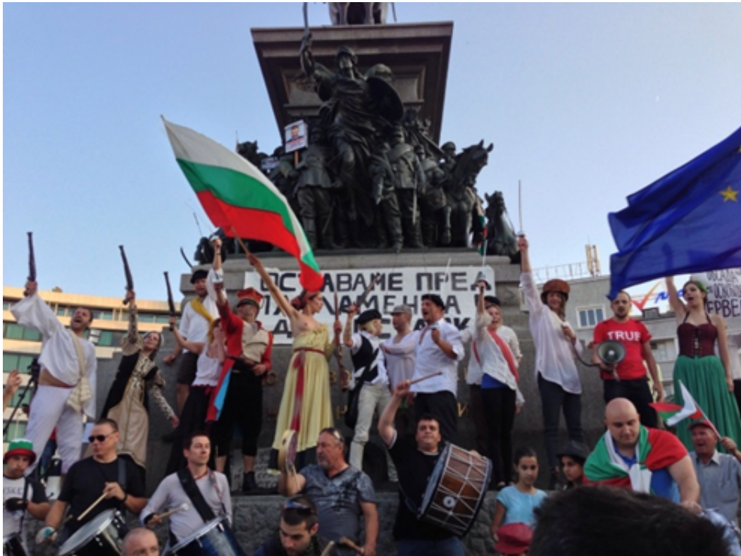
flashmobe he during the protest