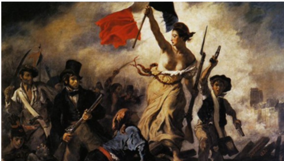
Delacroix - "Freedom Leads the

In 2013 the protesters organized a flash mob and they presented in front of the Bulgarian Parliament building- the situation from Delacroix's painting "Freedom Leads the People". On the face of it, this is outside the traditional rhetoric, but it is a way to present the values of democracy. The posters with the appeals are part of the flash mob and there is syncretism.