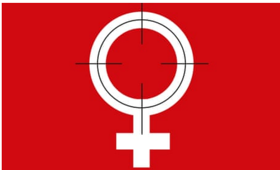
Photograph: Guardian Design

Team (source: The Guardian , 25/04/2018)